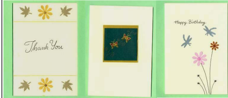
Happy Birthday, Thank you cards..