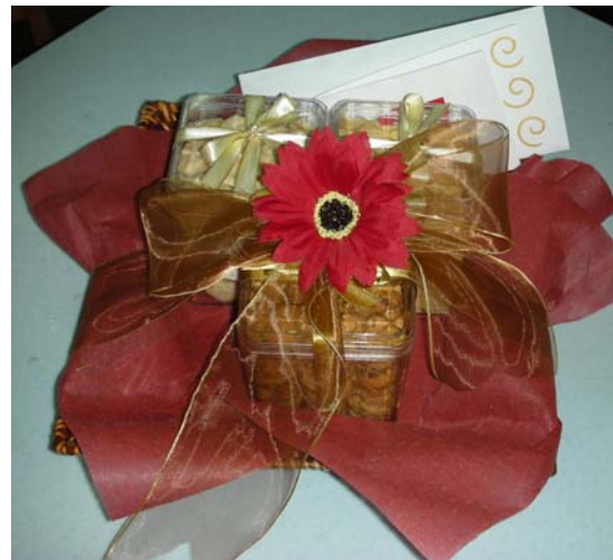
New Year Hamper with assortment of cookies