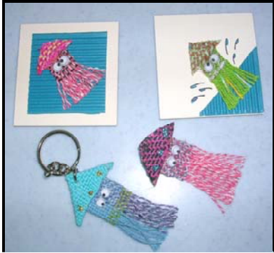
Saori Octopus Magnet & KeyChain