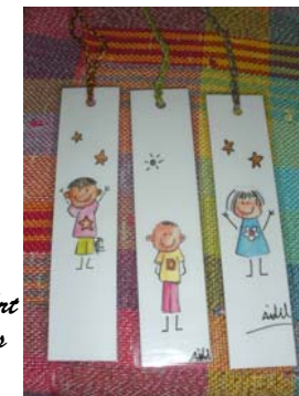
Aidil's Special Art Bookmarks