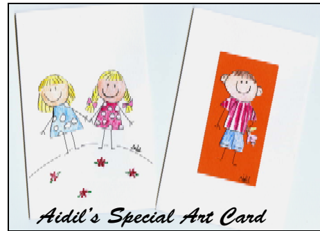
Aidil's Special Art Card