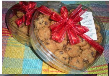
Choc 'N' Nut Cookies